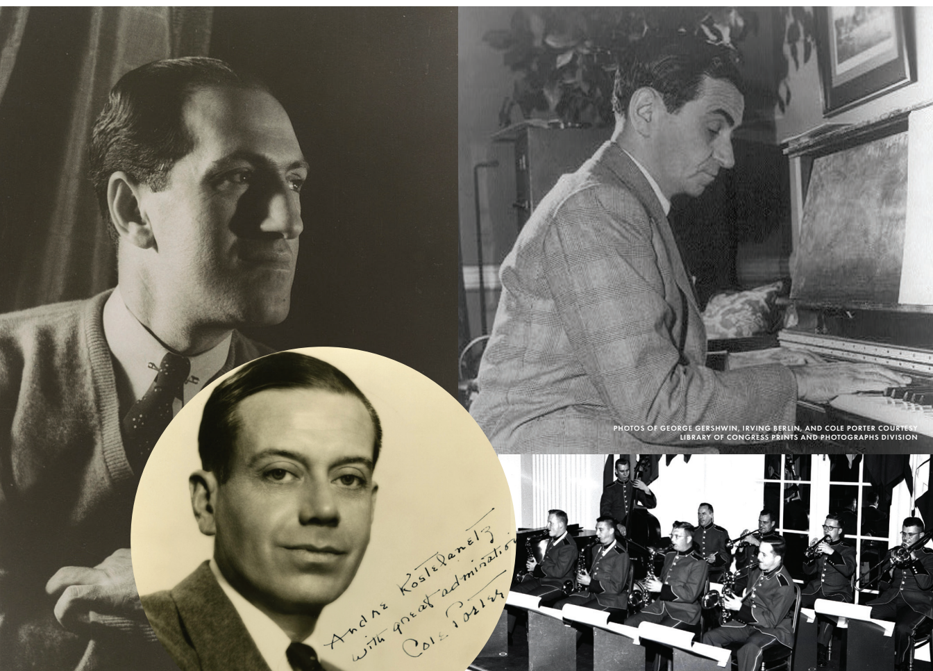
PHOTOS OF GEORGE GERSHWIN, IRVING BERLIN, AND COLE PORTER

A nostalgic window into the past and a dynamic reflection of the present, the Great American Songbook has come to define American popular music for the entire world. The “Songbook” is not a literal book, but a canon of popular songs and jazz standards primarily from the 1920s through the 1960s. These timeless tunes originated from various sources, including Broadway theater, Hollywood musicals, and New York City’s Tin Pan Alley. Think of iconic songs like Irving Berlin’s “Puttin’ on the Ritz,” Duke Ellington’s “Take the ‘A’ Train,” George and Ira Gershwin’s “I Got Rhythm,” and Hoagy Carmichael’s “Stardust.” The music of these composers outgrew their original contexts and became a rich scaffold for jazz improvisation and reinterpretation by artists in different genres. Take, for example, the myriad versions of Cole Porter’s “Begin the Beguine,” from the big band versions by Artie Shaw or Ella Fitzgerald, to Julio Iglesias’s Spanish-language version, to Johnny Mathis’s disco version. The beauty of the Songbook lies in its ability to create a dialogue across time and space. It offers a unique opportunity for artists and audiences to connect with iconic performances of the past while creating new versions that speak to the current moment. This enduring quality is why the Great American Songbook continues to be a relevant and cherished part of our musical heritage.