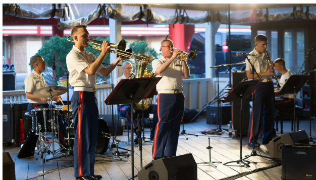
The Marine Dixieland Band performed favorites at Glen Echo Park in Maryland on Aug. 24 as part of "The President's Own" Summer Concerts. Selections included works made famous by Louis Armstrong, as well as Dixieland arrangements of music from George Gershwin's Porgy and Bess.