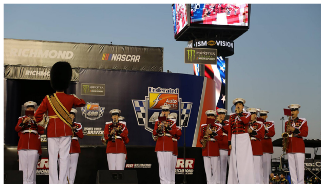
On Sept. 9, 2017, "The President's Own" United States Marine Band performed "God Bless America" and the National Anthem for NASCAR's Federated Auto Parts 400 at the Richmond Raceway in Virginia.