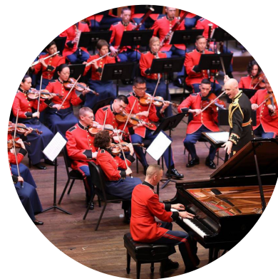
Marine Chamber Orchestra Concert March 2019