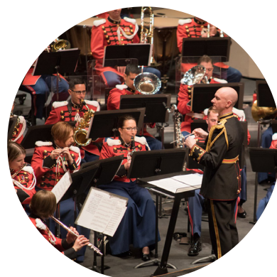
Sousa Season Opener January 2019

Total number of musical performances presented by members of “The President’s Own” from January-March 2019. From solo playing to small ensembles and the full band or orchestra, members perform several times each week through multiple musical commitments, including public concerts, White House musical support, full honors funerals, patriotic openers and other ceremonial duties.