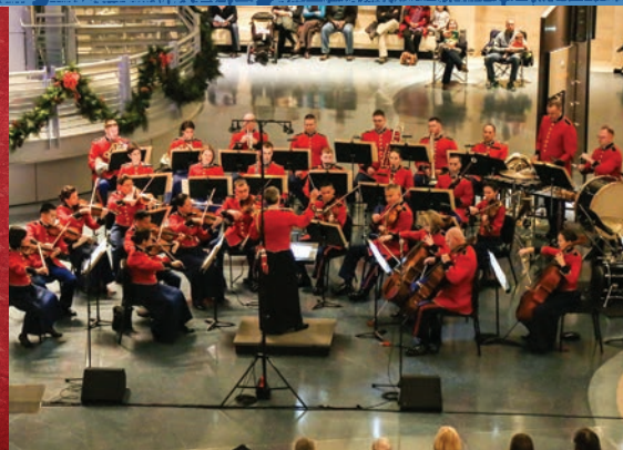
The Marine Chamber Orchestra will perform holiday favorites in December.