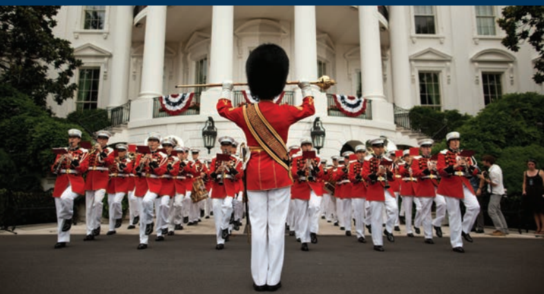
"The President's Own" at the White House, July 4, 2009.