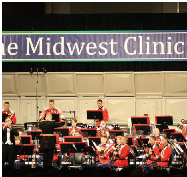
“The President’s Own” will perform three concerts and host a Sousa Clinic at The Midwest Clinic in Chicago in December.

The chamber music program will be anchored by