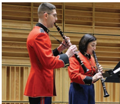
Various ensembles will perform during the Fall Chamber Series in October.

Johannes Brahms Quintet in B minor for Clarinet and Strings, Opus 115