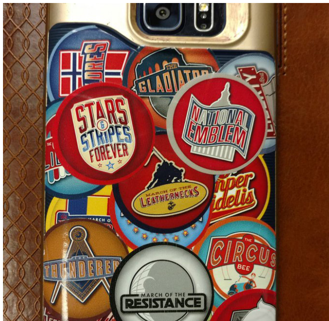
Some students decorated their phone cases with the icon stickers of each participating march.

the contest, we do a bit of discussion on marches through our method book,” she explained. “Then we spend a couple of days listening to the beginning of each song. Each student fills out a bracket. I then total up each of their choices before the event starts. On the day of voting, I submit our class vote by what the majority of the class selected. The students also keep a running tally of how many they got correct. Once a song is ousted, we listen to it in its entirety, as a class. On the last day, we listen to both songs in their entirety and discuss the information. The students ‘campaign’ for what they like about the march and why it should win.”