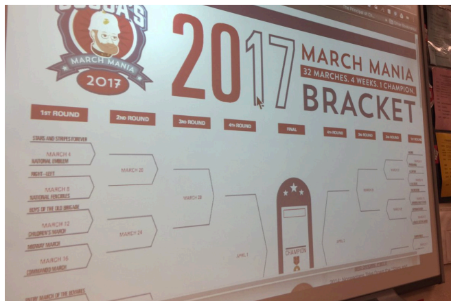
Students at Norfolk Middle School in Norfolk, Neb. would vote daily.