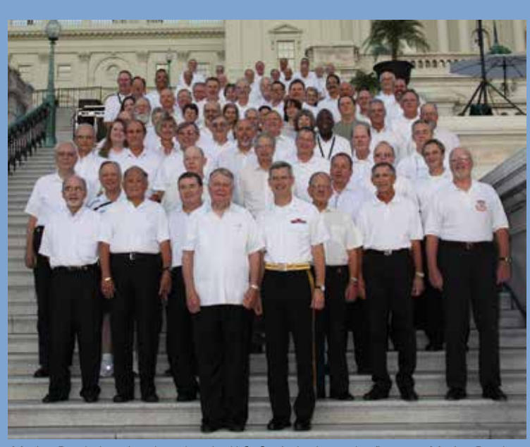
Marine Band alumni gathered at the U.S. Capitol prior to the first ever Marine Band Alumni Concert on Aug. 25, 2010.