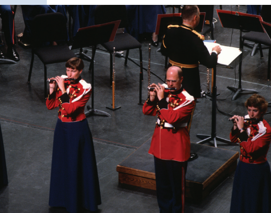
The Marine Band on Oct. 13, 1994 at the Lied Center in Lawrence, Kan. The band will return to the venue on Sept. 12.

Saturday, Sept. 13 at 7:30 p.m. Concordia, KS Cloud County Community College Arly Bryant Gymnasium bladeempire.com (785) 243-2424