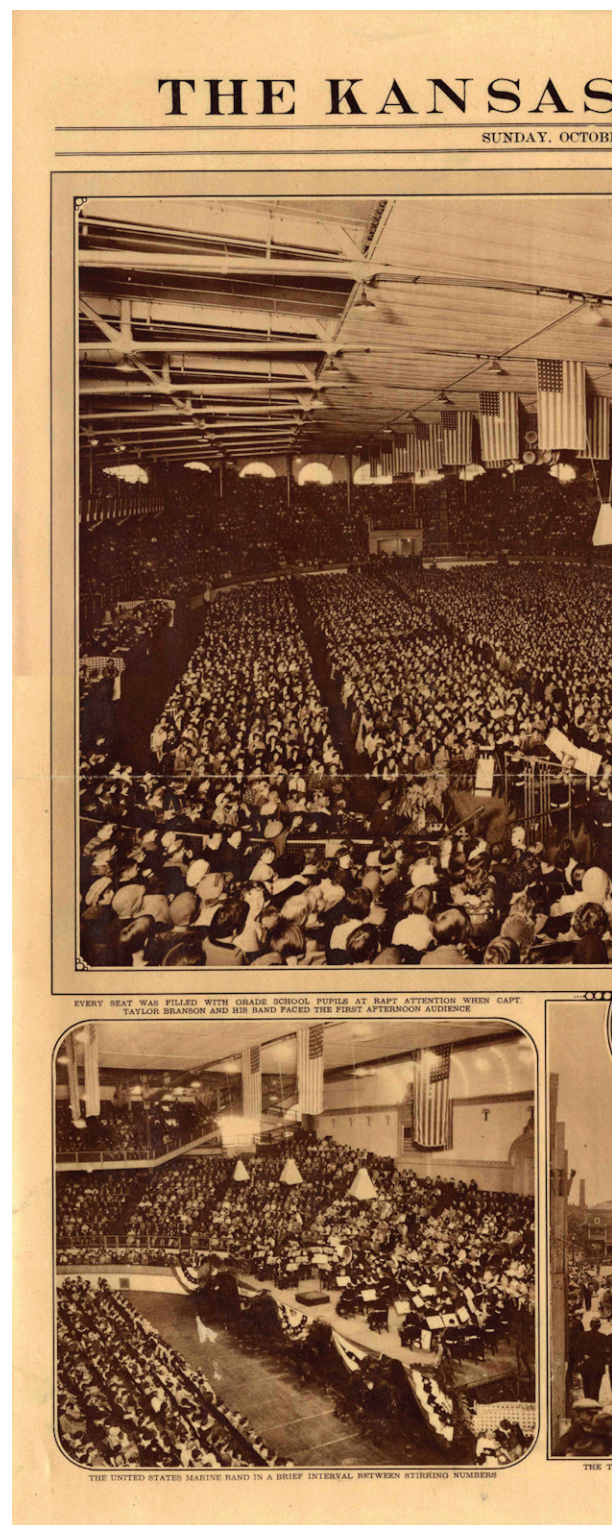
The Kansas City Star on Oct. 3, 1929, features coverage of the Marine Band in Kansas City, Mo. on Sept. 10 and will perform at Helzberg Hall at the University of Kansas, October 13, 1929