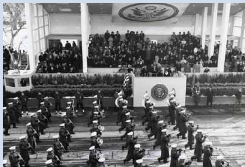
"The President's Own" United States Marine Band plays during the inaugural parade of President John F. Kennedy, Jan. 20, 1961