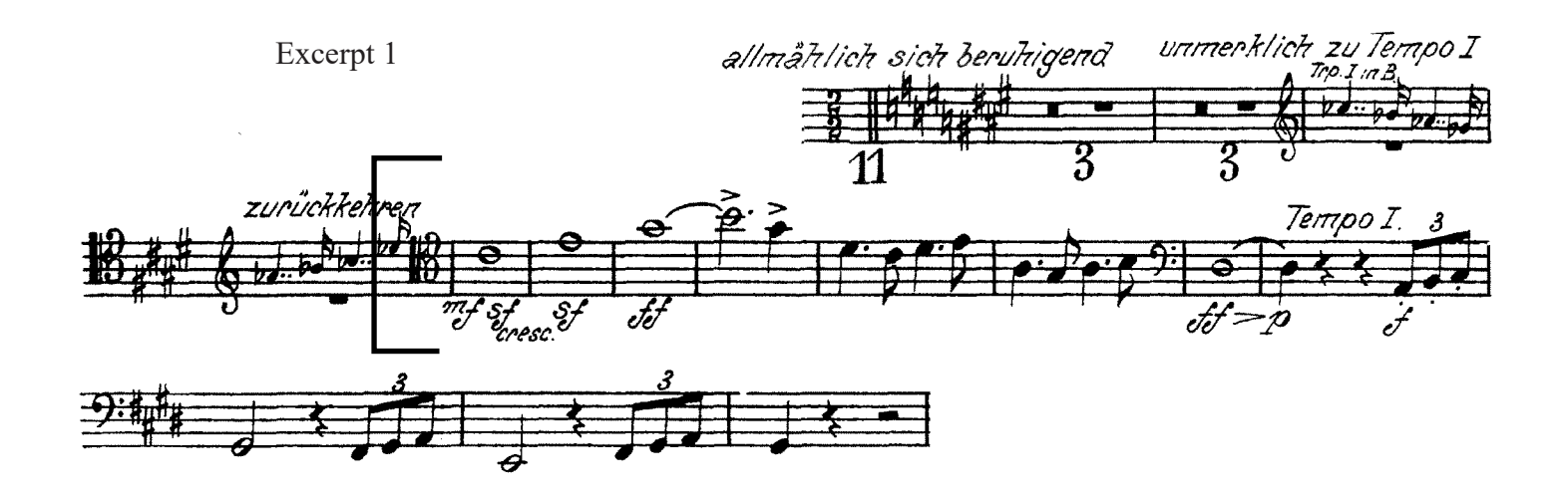
Symphony No. 5 in C-sharp Minor (Mahler) - 2nd trombone