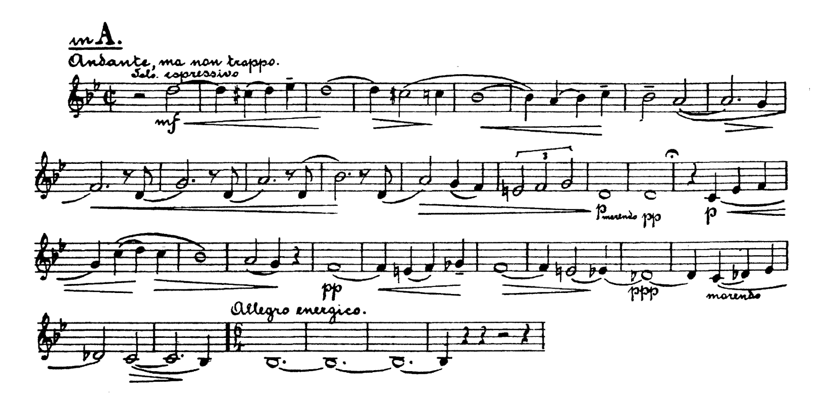
Symphony No. 2 – 3<sup>rd</sup> movement (Rachmaninoff)