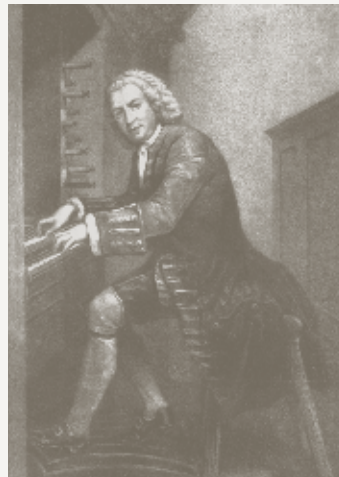
Johann Sebastian Bach (1685–1750)