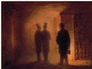
Viktor Hartmann: Paris Catacombs

8. “Catacombs” (A Roman Sepulchre) With the Dead in a Dead Language—Hartmann’s portrayal of the Parisian catacombs, one of the collection’s most evocative and personal images, has survived. It depicts the artist himself, along with a friend and their guide, as they are about to tour the catacombs by lamplight. To the right of the entrance is a large case of skulls glowing in the darkness, a detail that attracted Mussorgsky’s attention.