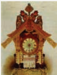
A clock in the form of the hut of Baba-Yaga, design study by Viktor Hartmann