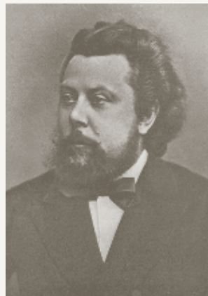
Modest Mussorgsky, 1870

from the European training and influence that had held sway over Russian music, art, and literature. Both were intrigued by folk and popular elements of Russian history and culture, and were determined to use them in