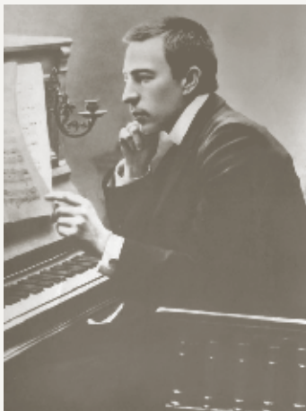
Sergei Rachmaninoff at the piano, early 1900s, about 27 years old

were conceived at the keyboard. In fact, he put the finishing touches on his two-piano version of Symphonic Dances several months before the orchestral version was completed, technically making the orchestral version a transcription of the two-piano “original.” While this assertion may be a stretch, it does reinforce the close relationship between keyboard and large ensemble works for many composers.