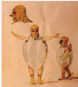
Viktor Hartmann: "Canary chicks, enclosed in eggs as in suits of armor. Instead of beaddress, canary heads put on like helmets down to the neck."