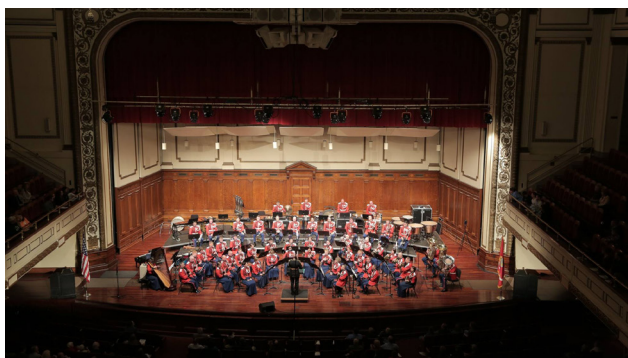
On Oct. 19, 2017, the U.S. Marine Band performed in Symphony Hall in Springfield, Mass. The concert was sponsored by Spirit of Springfield.