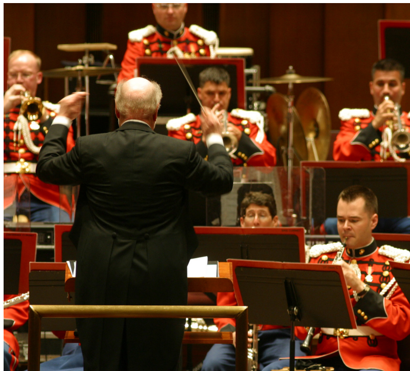
The Marine Band performed John Williams’ Theme from Schindler’s List in 2003 at the Kennedy Center under the composer’s baton. The band will perform the piece again in a joint concert with the NSO honoring veterans on Nov. 10 at 7 p.m.

The second half of the program will be presented by the National Symphony Orchestra led by its new music director Gianandrea Noseda. Noseda was named the National Symphony Orchestra’s seventh music director in January 2016. He has served as Music Director of the Teatro Regio Torino in Turin, Italy since 2007. Noseda also serves as Principal Guest Conductor of the London Symphony Orchestra and the Israel Philharmonic Orchestra, Principal Conductor of the Orquestra de Cadaqués, and Artistic