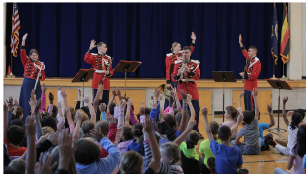
On Oct. 4, 2017, a woodwind quintet from the U.S. Marine Band performed a Music in the Schools program at the Arlington Traditional School in Arlington, Va.