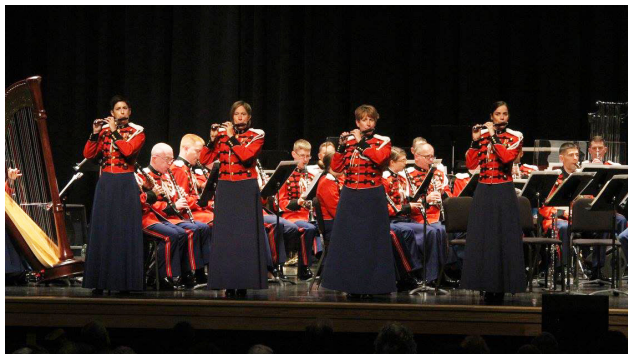
On Oct. 1, 2017, the U.S. Marine Band kicked off its National Concert Tour with a performance at Lampeter-Strasburg High School in Lancaster, Pa. The concert was sponsored by the New Holland Band.