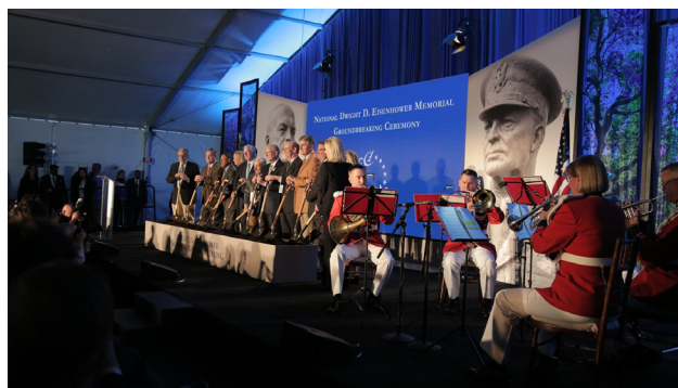
On Nov. 2, 2017, a brass quintet from "The President's Own" U.S. Marine Band performed for the groundbreaking of the Dwight D. Eisenhower Memorial in Washington, D.C.