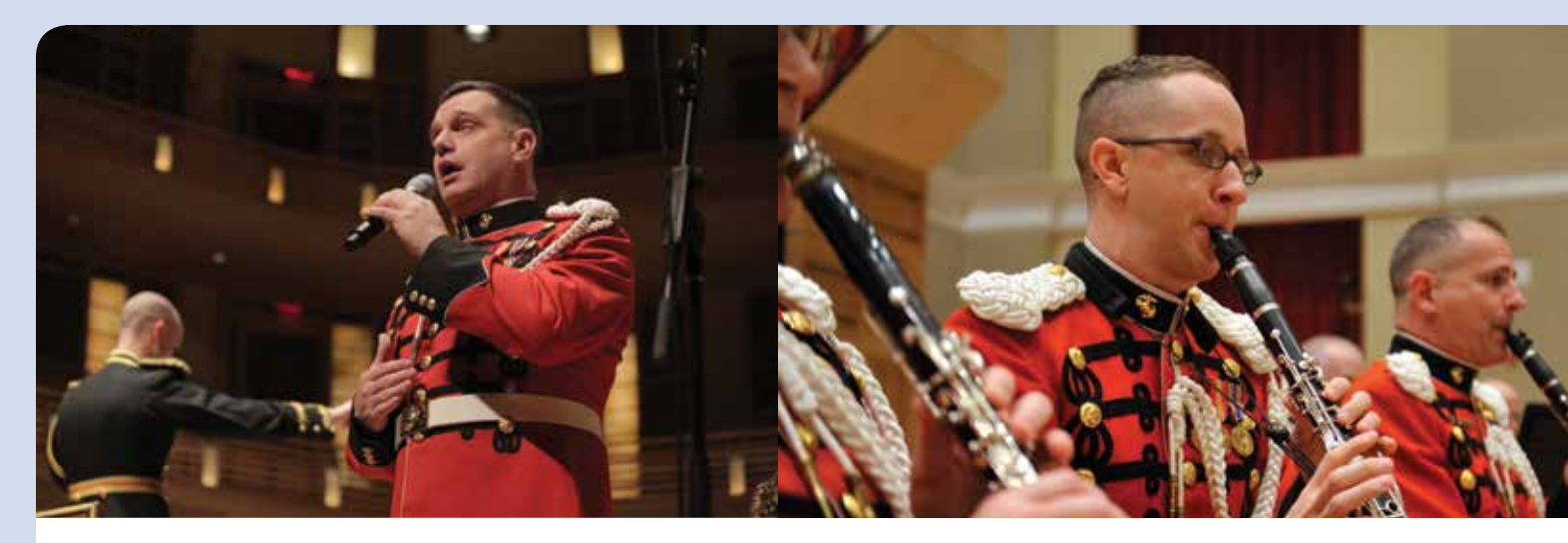
TOUR continued from page 1

excellence of its symphonic arrangements, and been entertained by its novelties, and thrilled by its soloists."