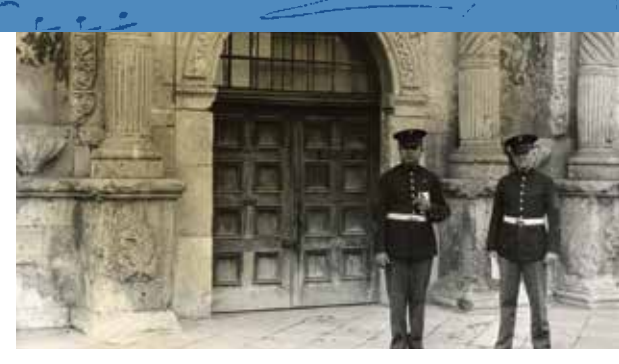
Marine Bandsmen pose in front of the Alamo in Texas during the 1929 Concert Tour. The Marine Band returns to the southwest this year, including nine concerts in Texas.

Monday, Oct. 5 at 7:30 p.m. College Station, TX Rudder Auditorium, Rudder Theatre Complex, Texas A&M University