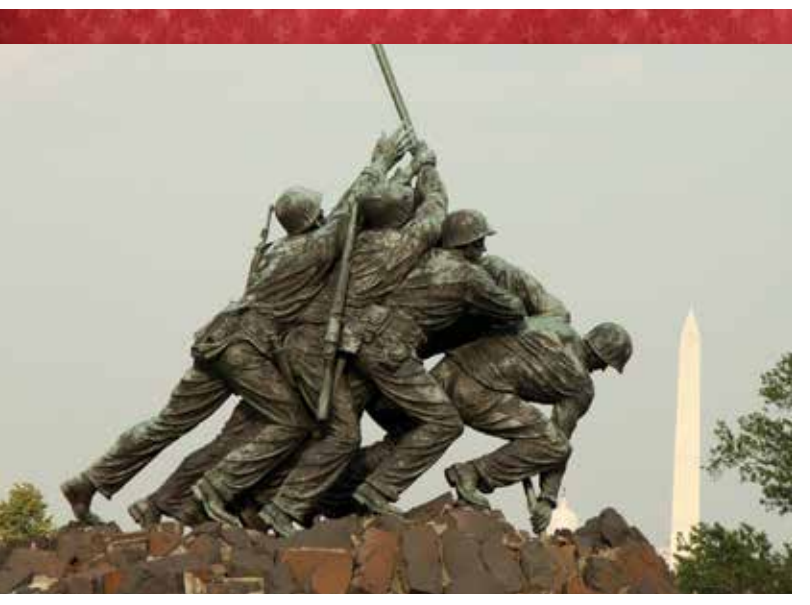
The Marine Corps War Memorial in Arlington, Va., depicts Joseph Rosenthal's photo of the five U.S. Marines and one Navy corpsman who raised an American flag on the island of Iwo Jima on Feb. 23, 1945.

Back in the nation's capital, the Marine Band provided music for war bond rallies and patriotic dinners and dances to boost morale among the American people. At the White House, the band supported an unprecedented