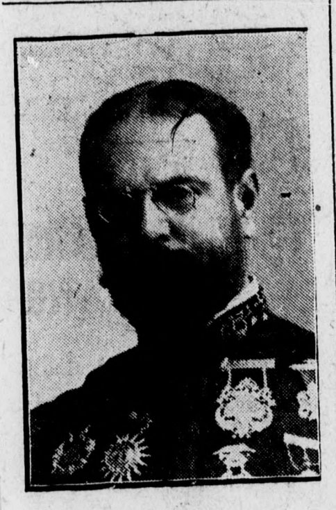
JOHN PHILIP SOUSA.

a musical point of view was "Till Eulen-spiegel's Merry Pranks," by Strauss, the most modern and daring composer of the German school. It gave the band an op-portunity to show the high standard of