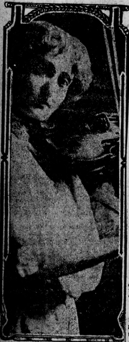
GIANCINTHA DELLA ROCCA.

VIOLINIST AT BIG PARK SQUARE FOOD FAIR FROM EUROPEAN TRIUMPHS