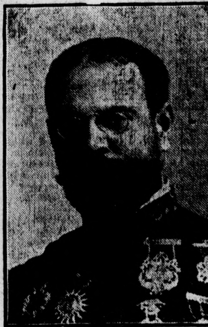
JOHN PHILIP SOUSA.

Lovers of music turned out in large numbers yesterday to enjoy the two excellent concerts at Infantry Hall rendered by Sousa's Band and soloists. The affair