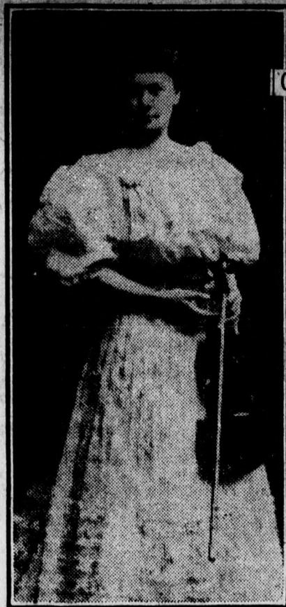
Violin soloist with Sousa's band at Exposition.